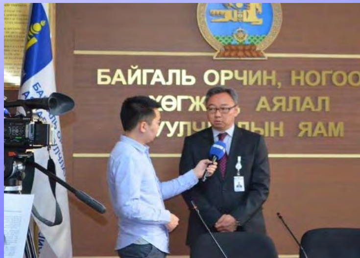
Pic 2, 3 and 4. Press conference during the launching event