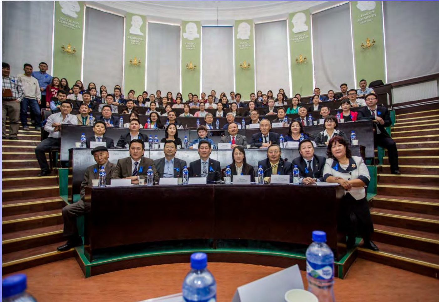
Pic. The referees and the participants of the conference